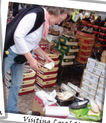
Visiting Local Markets