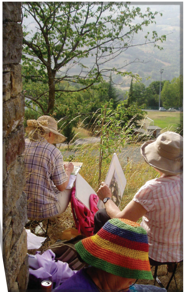
And the views...