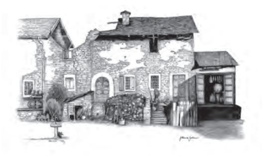
Paesano Tours Art + walks + Culture