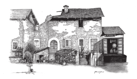
Paesano Tours Art + walks + Culture

Ev is keen to explore and share her trip to this unique country with her students. Be part of the magic as she makes the seemingly impossible