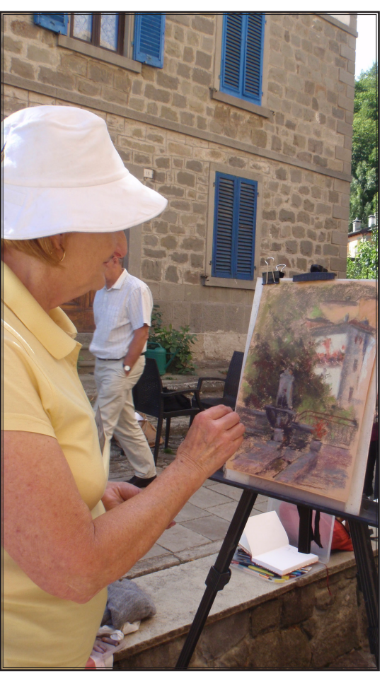
Many activities for non-painters too