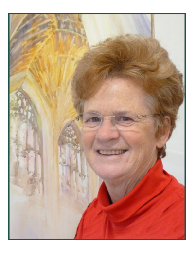
19 Sept - 3 Oct 2015 Tuscan Hills/Emilia Romagna ITALY