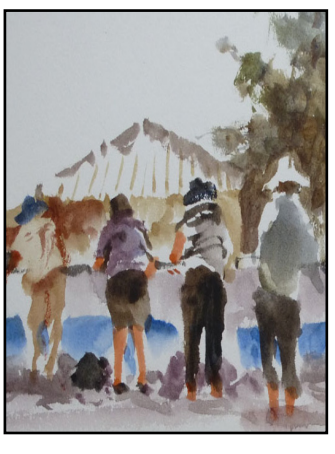
Ev paints and teaches on location to replenish her creative bank. The perfect medium for outdoors is watercolour.

Ev's teaching expertise includes techniques suited to any conditions. She will show new ways to interpret the magic you are seeing when travelling.